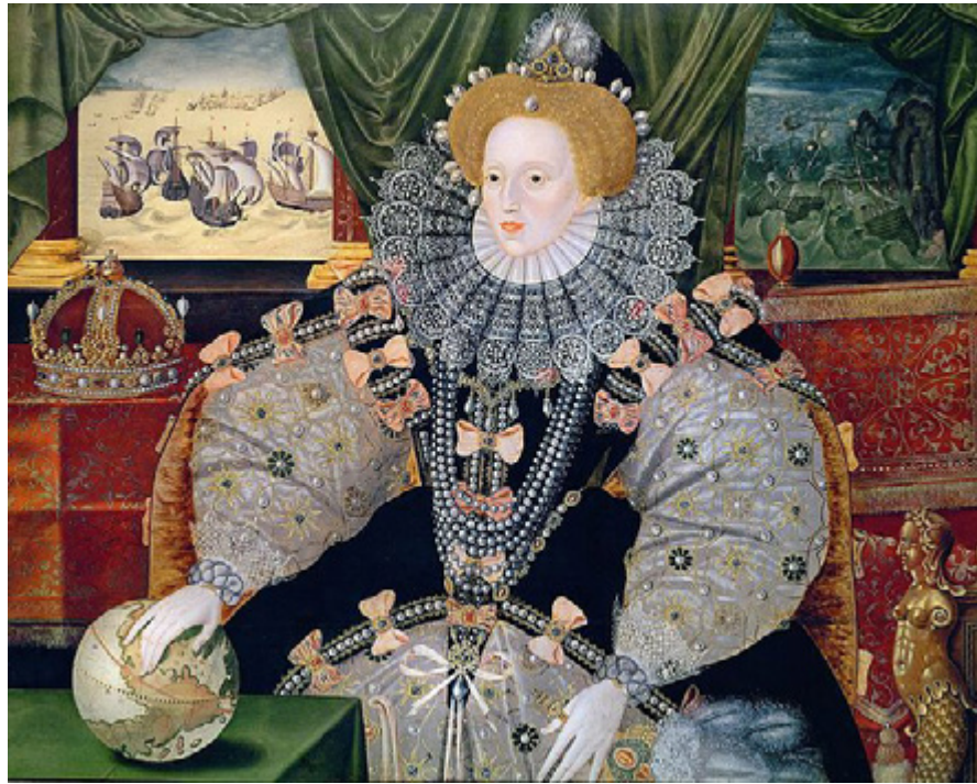
Figure 2: Official portrait of Queen Elizabeth I

Queen Elizabeth I has been played more often in film and on television than any other British monarch in history. Cate Blanchett played her in 1998 and Judi Dench won an Oscar for playing her that same year.